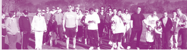
Participants in Goality's Fun Run/Walk 2010

The Center received the donations from two fundraisers in April and May planned by supporters of the CAC.